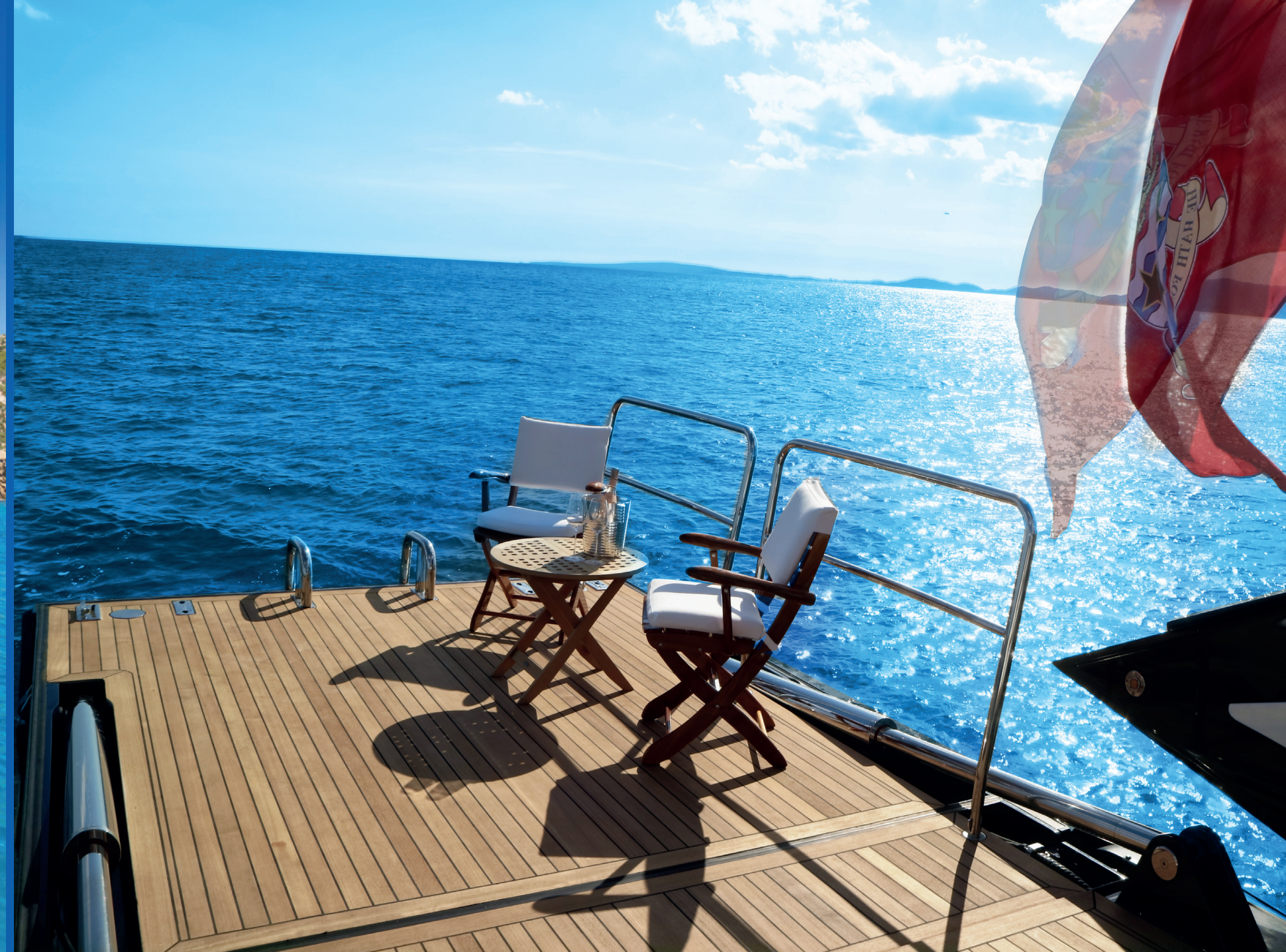
SWIN / BEACH PLATFORM