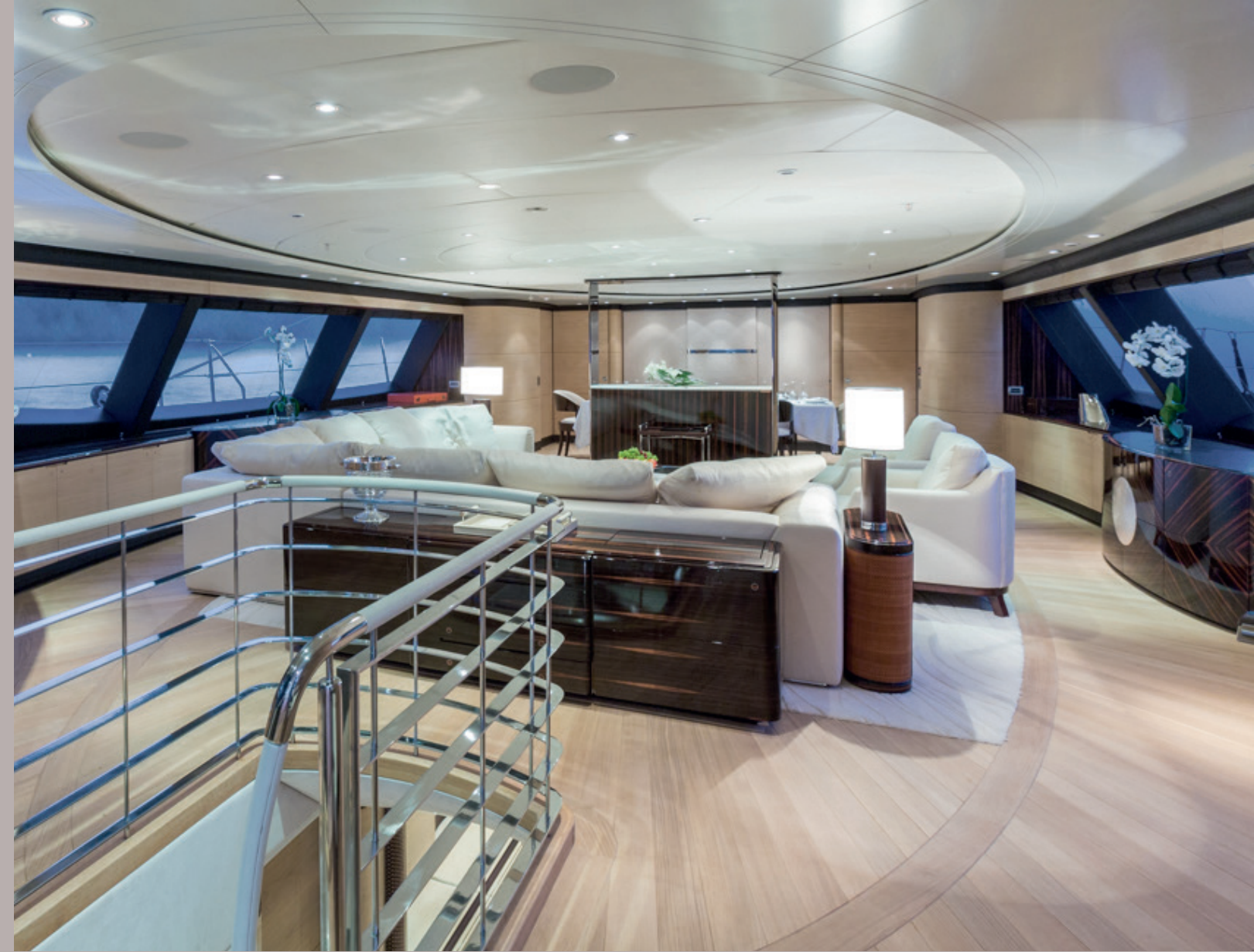
MAIN SALOON WITH 65" OLED TV