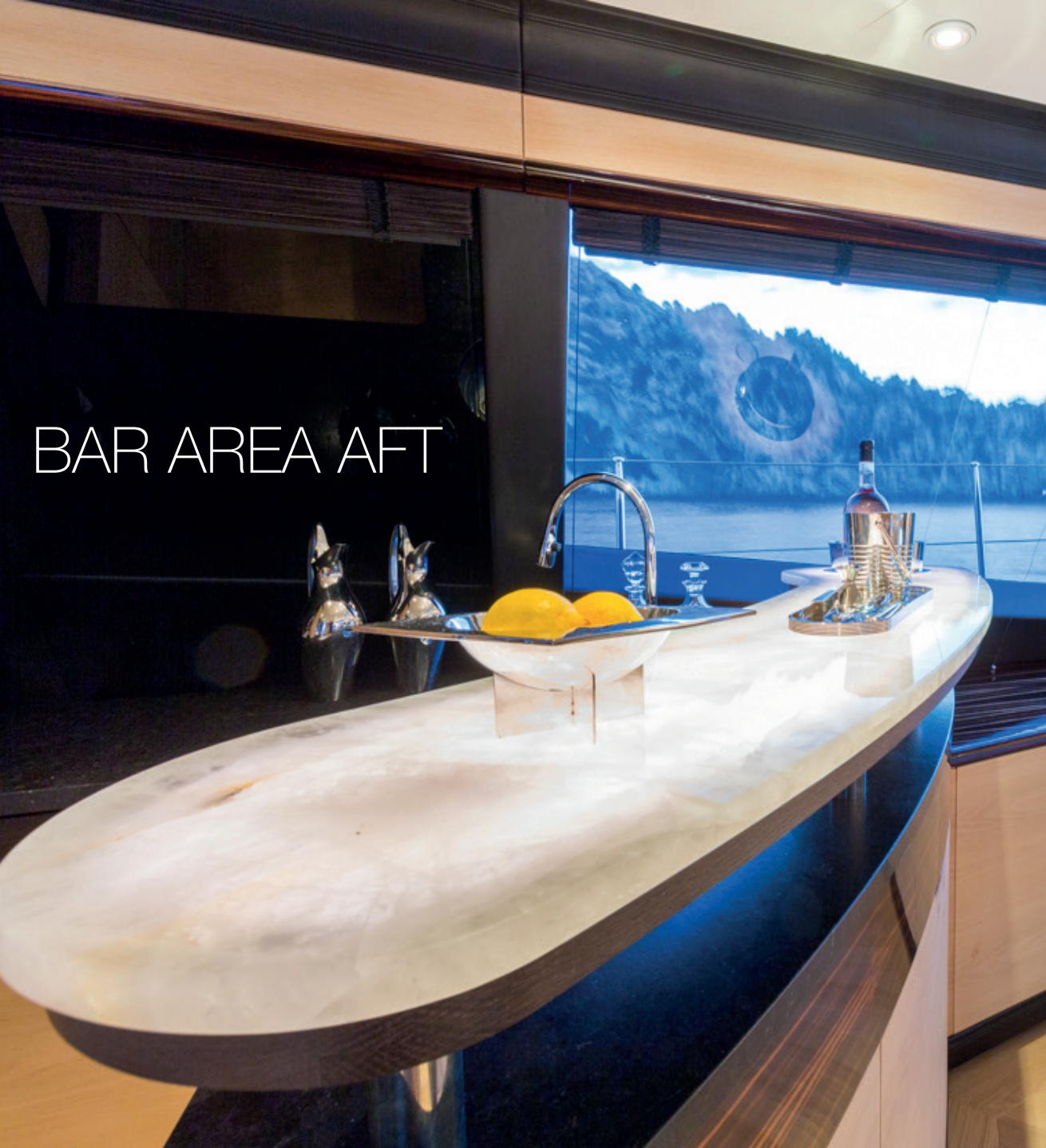
BAR AREA AFT