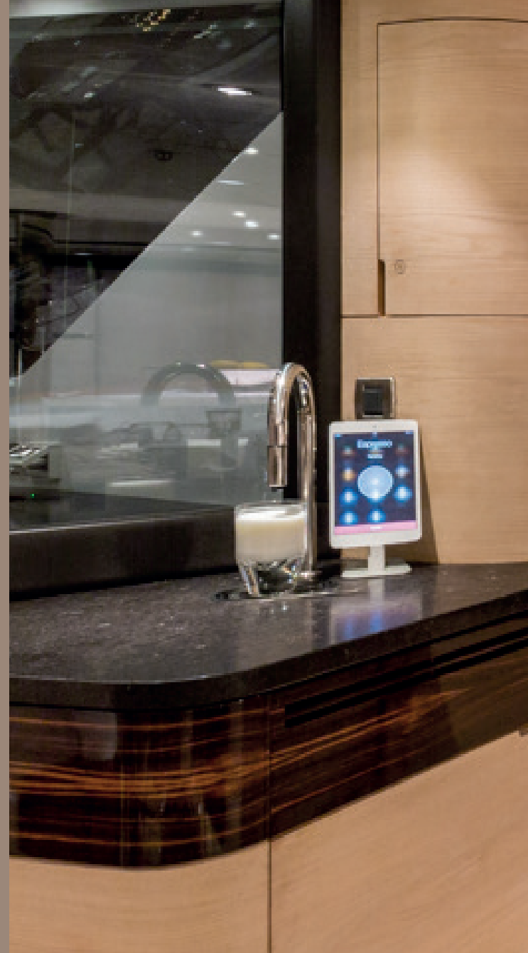
APP CONTROLLED TOPBREWER